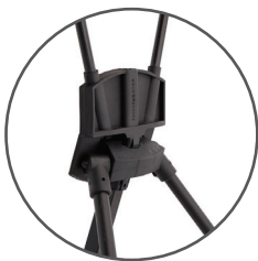
Rod fixing detail