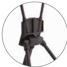
Rod fixing detail