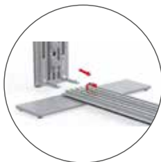
Conectores para LED